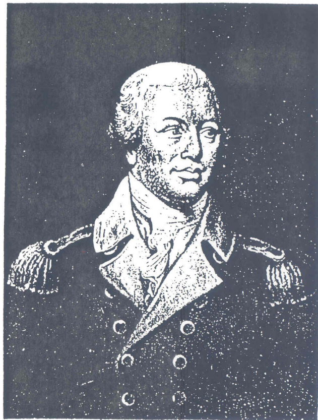
General Nathanael GREENE