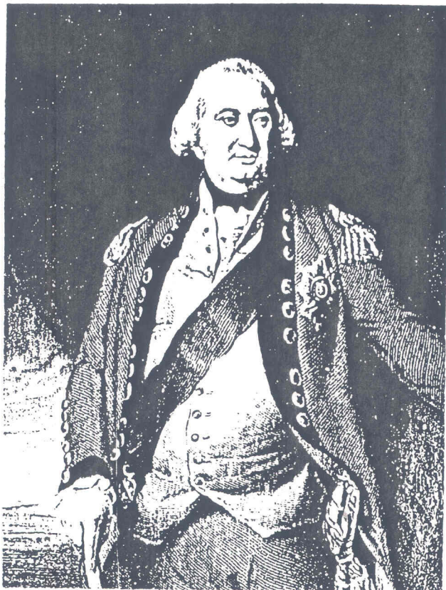
General George CORNWALLIS

After their defeat at King's Mountain [S.C., October 1780], the British under CORNWALLIS had pulled back to Winnsboro, S.C., in preparation for an invasion of North Carolina. GREENE had inherited an army of almost 2,500 men... on paper,